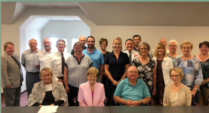
Danville Area Community College Foundation Board of Directors and Staff