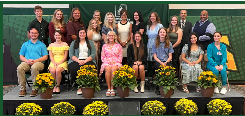
Second Year Presidential Scholars