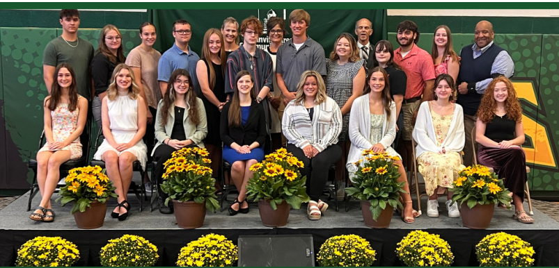
First Year Presidential Scholars