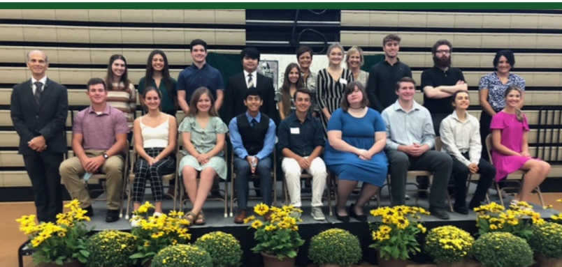
First Year Presidential Scholars