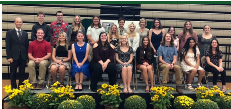
Second Year Presidential Scholars