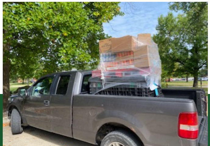
Pictured (above) is 790 pounds of food in the back of DACC Dual Enrollment student/volunteer Mac Hill's truck.

Using 190 pounds of free snacks from the East Central Illinois Food Bank, the Foundation purchased baskets and set them around campus as free snack baskets for students.