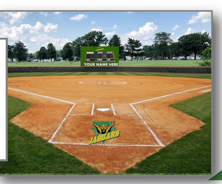
A rendering of the proposed women's softball field, which would be situated on the northern lawn of the Danville Campus.

The College has designed a new softball field for the